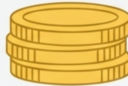
The American Mailer

This affordable, high-impact solution ensures your brand is seen by the community. By sharing the mailer, you get the benefit of direct mail without the high price tag of a solo campaign. Our premium, eye-catching mailer ensures you stand out.