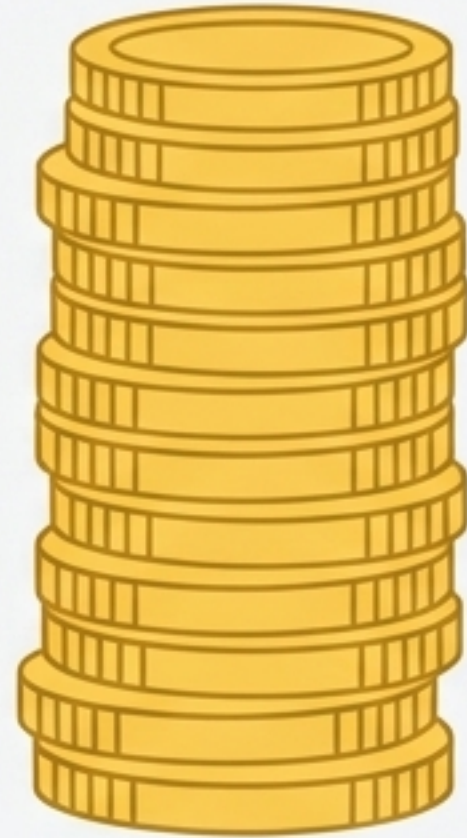
Solo Direct Mail

Achieve top-of-mind awareness at a fraction of the usual cost.